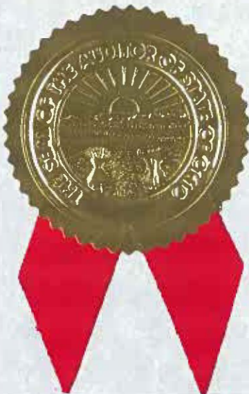
Keith Faber, Auditor of State

Your exemplary reporting serves as the standard for clean, accountable government, representing the highest level of service to Ohioans.